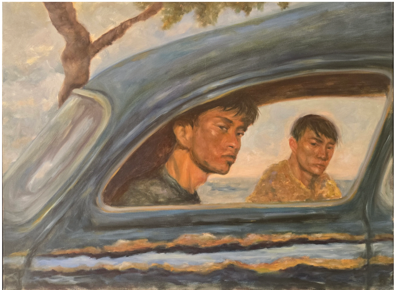
'Coast 1269' by Godofredo Astudillo | Credit: Courtesy