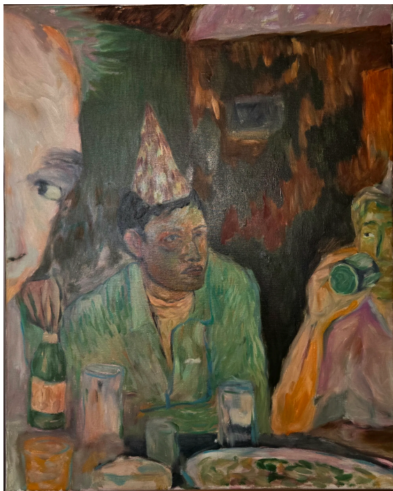
'Frankie's 1323' by Godofredo Astudillo

LA-based Filipino-American artist Godofredo Astudillo is presenting his debut solo show in Santa Barbara, and in an unexpectedly suitable setting. Winner of the Museum of Contemporary Art Santa Barbara's "Call for Entries," the artist's work hangs in the lobby and walls of the Riviera Beach House, a boutique hotel just a few blocks from the beach and at the portal to the Funk Zone.