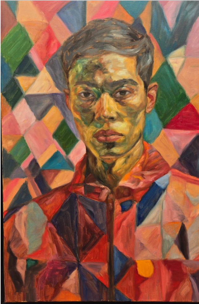
'West Jefferson' by Godofredo Astudillo

A horizontally pitched image finds two stern young men mysteriously perched in the back seat of a bulbous vintage car, casting suspicious gazes amidst the moodily painted scene with a strip of ocean blue teasing the eye through the car window. By contrast, a portrait of a man swimming in a color scheme with a nod to the Fauvist palette in the rendering of his face. Further expanding the palette, his checkered shirt is playfully matched by the painting's checkered backdrop (or wallpaper), like Catherine Deneuve in Umbrellas of Cherbourg .