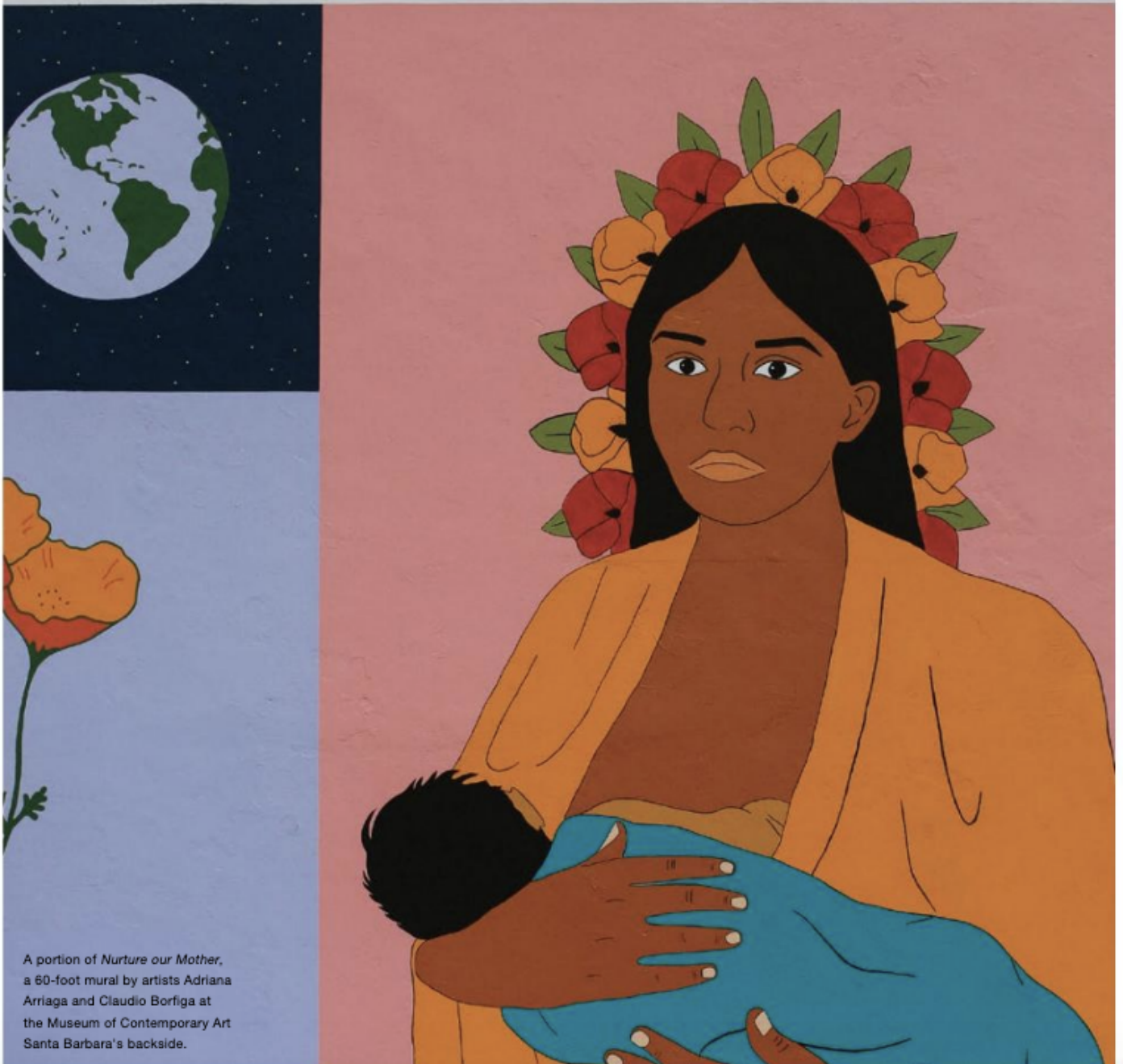
A portion of Nurture our Mother , a 60-foot mural by artists Adriana Arriaga and Claudio Borfiga at the Museum of Contemporary Art Santa Barbara's backside.

A plethora of not-to-miss museum and gallery reopenings and shows