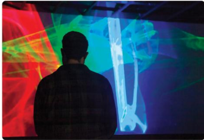
Lunchboxing with Lasers is the newest exhibit at the MOXI

MUSEUMS ALONG STATE: OFFERING A TOUCH OF THE NEW AND THE FAMILIAR