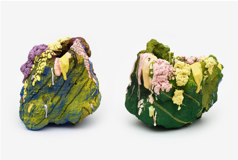
Left: Brian Rochefort, Purple YETI , 2019, Ceramic, glaze, glass fragments, Approx. 16.5 x 18 x 18 in., Courtesy the Artist Right: Brian Rochefort, The Breeder , 2019, Ceramic, glaze, glass fragments, Approx. 15 x 16 x 16 in., Courtesy the Artist

Exhibition on View: August 1 – September 8, 2019