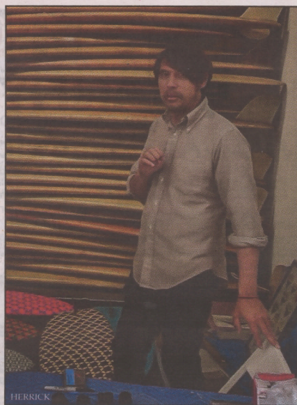
ABOVE, In his MCASB show, San Francisco-based artist Barry McGee includes surfboards by Santa Barbara shapers amidst others that he has painted with vivid geometric designs.

"Barry McGee: Mid Summer Intensive" is on view from July 1 to October 14, 2018 at the Museum of Contemporary Art Santa Barbara, 653 Paseo Nuevo, Santa Barbara.