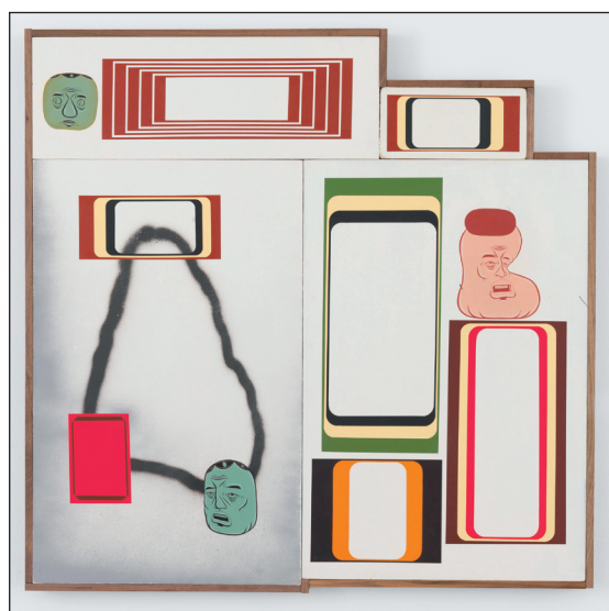
Untitled by Barry McGee 2017, Acrylic, gouache, and aerosol paint on panel, 4 elements, 38.5 x 39.25 x 1.75 in.