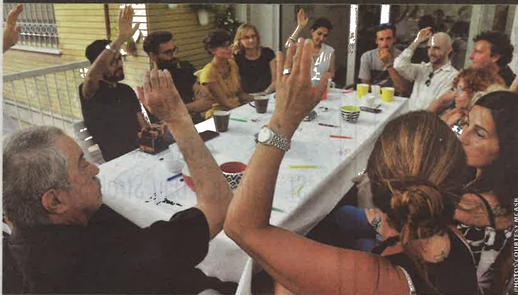
HANDS UP: Participants in Rimini Protokoll's Home Visit USA answer questions and face challenges in a party game designed to raise awareness about issues of civil society in an age of increasing nationalism.