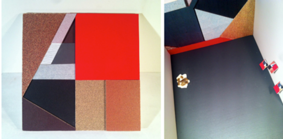
Zack Paul, Geometric Landscape #1 (Detail), 2012, Sandpaper and flashé vinyl on wood and cardboard, 12 x 12 in., Courtesy the Artist (Detail and Top View)